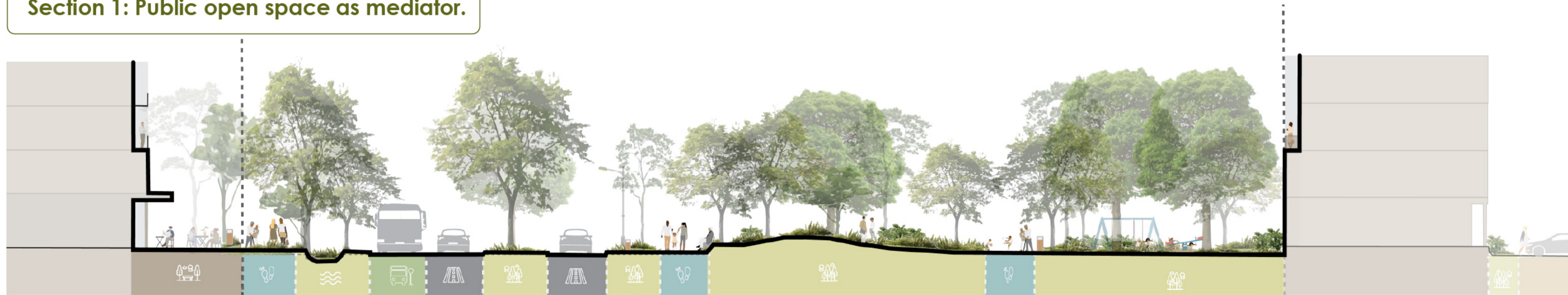
Section 1: Public open space as mediator.

The success of the public and semi-public realms relies on the interfaces with the developments around it. This will be considered within the development framework and is to be replicated within each development plot as they interact with either the public or semi-public realm within.